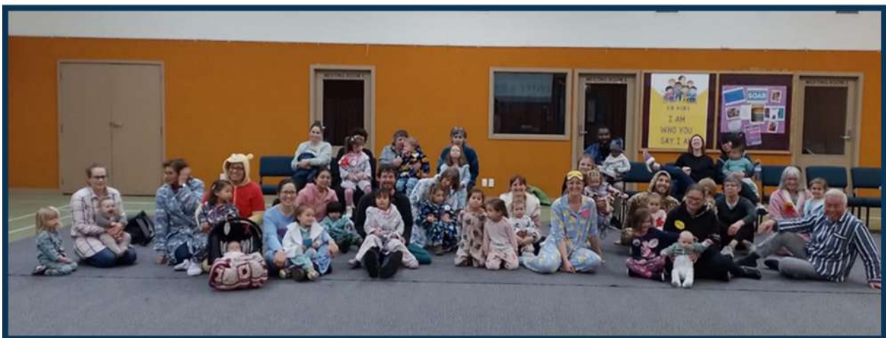
Photo from pyjama day 2024