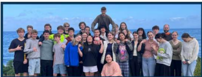
Deeper Retreat 2024

In August we went away for Deeper Retreat in Taupō and had a guest speaker come and speak to us about how the history of relationship between Te Ao Māori and Christianity and how that can inform connection moving forward.